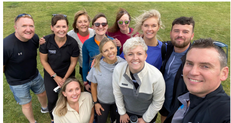
Team events, activities, meals, and more!