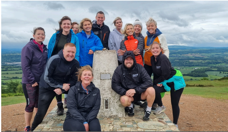
Lunchtime activities during team days