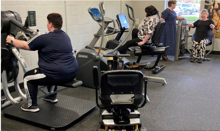
Encouraging movement to improve health outcomes