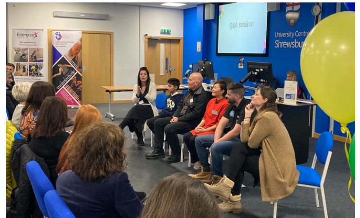
Celebrating impact of funding for local people