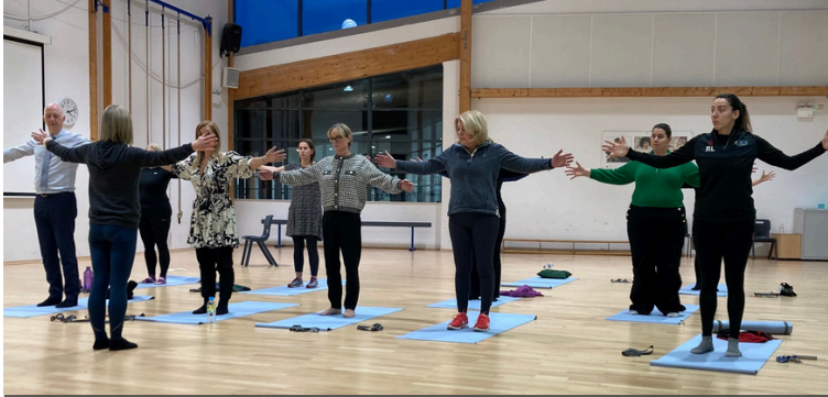
Opening School Facilities for physical activities