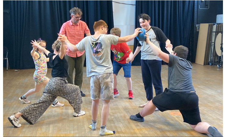
Activities for SEND children and their families