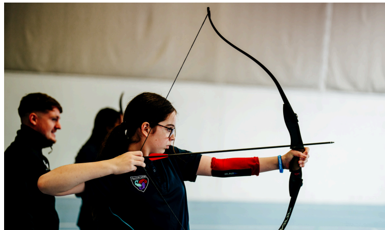
Engaging young people in different activities