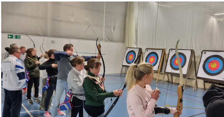
Trying new physical activities