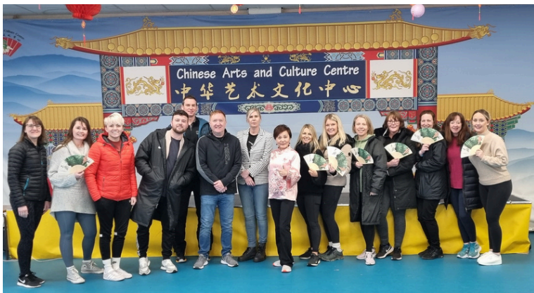
Supporting local organisations