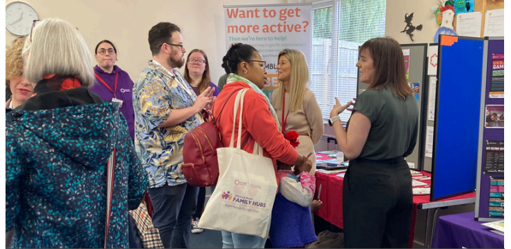
Collaborative working in Donnington, Telford