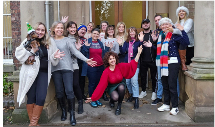
Celebrating events all year round